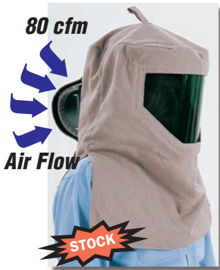
AG100H-A Hood with Cooling System