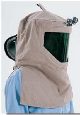
AG100H-AL Hood with Lamp & Cooling System

Battery Operated DETACHABLE cooling system for comfort and minimal lens fog (Batteries Included)