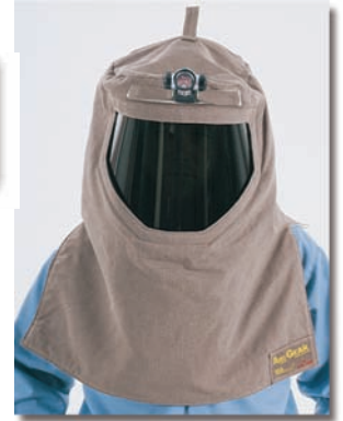
AG100H-L Hood with Detachable Lamp

Battery operated headlamp attaches to front crown of hood with VELCRO® (Batteries Included)